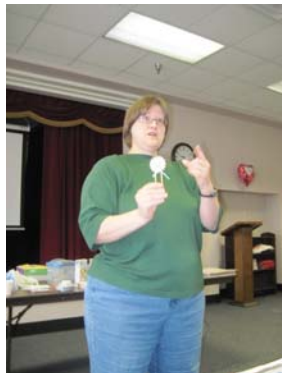
Learning How To Cricut with Piedmont District